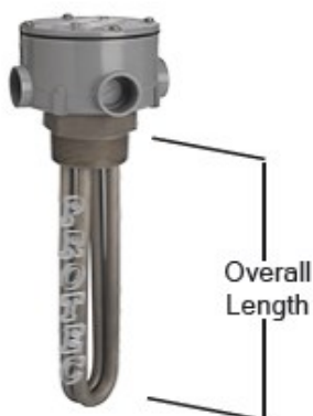
T2T 系列 2"螺牙金屬鈦加熱器